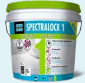
Data Sheet 36589.0